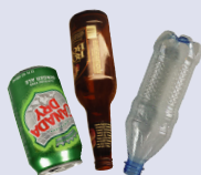
Empty cans & bottles