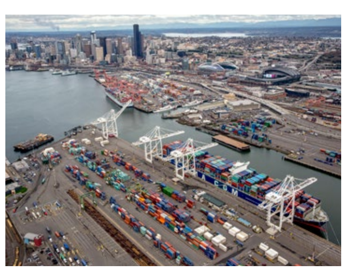
Clockwise from top: Sea-Tac Airport Concourse A; protected bike lane built as part of the Port-supported East Marginal Way grade separation project; aerial view of Terminals 18, 46 and 30